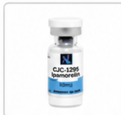
CJC/IPAMORELIN 10mg - NL-CJ05261