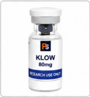
KLOW 80mg - PS-KLOW05261-80