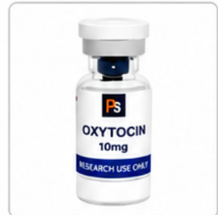
Oxytocin 10mg - PS-OXY05261