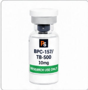
BPC-157/TB-500 10mg – PS-W05261